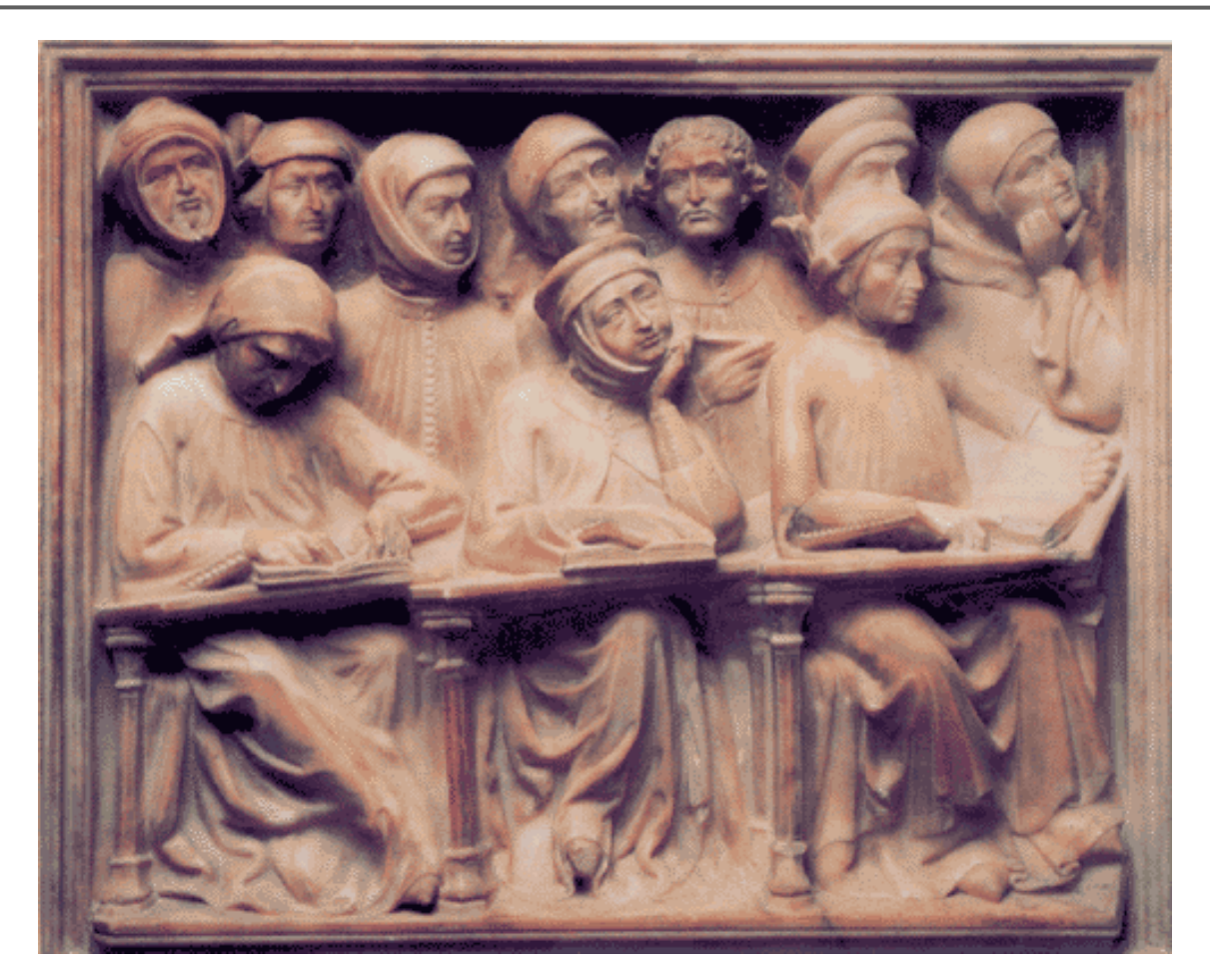
Founded in 1088